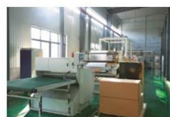
PC polycarbonate film workshop