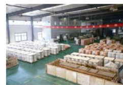
Finished goods warehouse