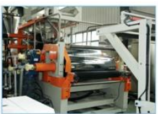
High grade PET production line