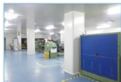
Class 100,000 purification workshop