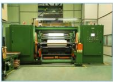
PVC film production line