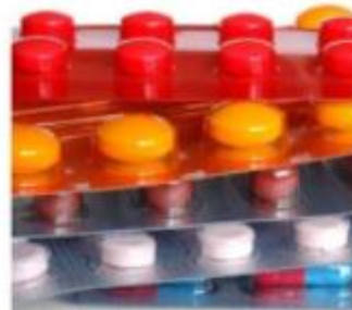
Tablets,capsules,injec table syringes